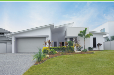
SECURITY & ALARMS

EZY SWITCH convenience, control and compatibility