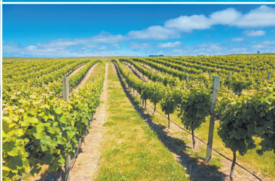
GENERATORS & PUMPS