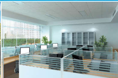
HEATING & LIGHTING