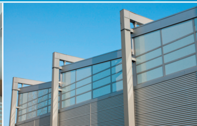
PLANT & EQUIPMENT

Control and monitor your appliances, and much more via SMS