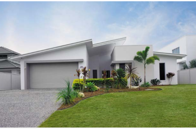
SECURITY & ALARMS

EZY SWITCH convenience, control and compatibility