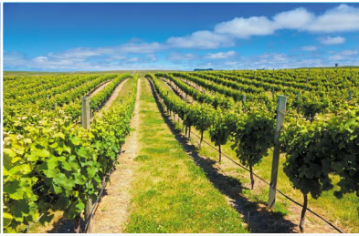
GENERATORS & PUMPS