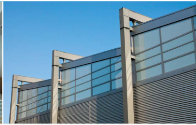
PLANT & EQUIPMENT

Control and monitor your appliances, and much more via SMS