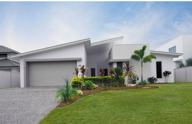
SECURITY & ALARMS

EZY SWITCH convenience, control and compatibility